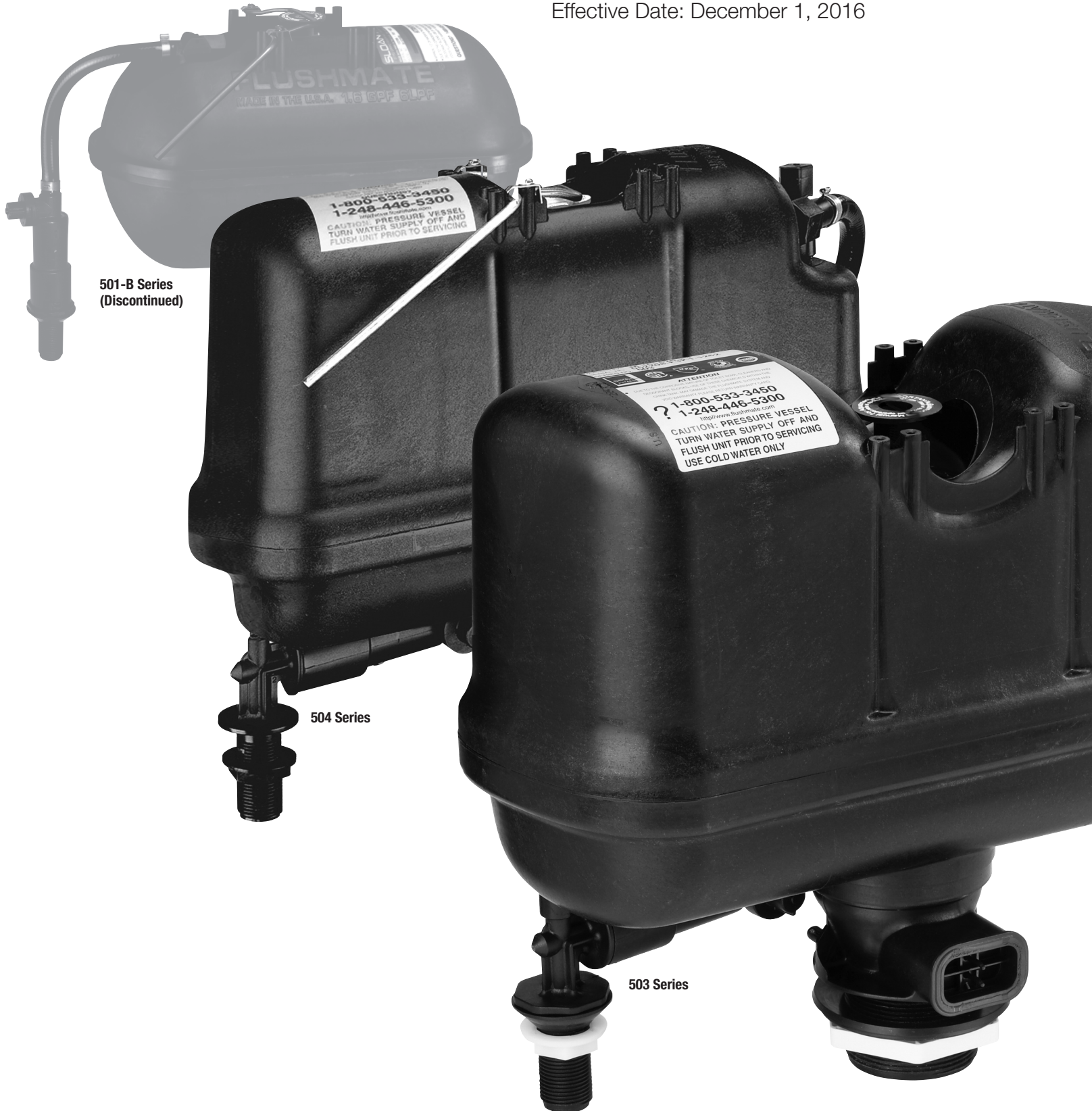
501-B Series (Discontinued)