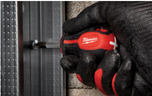
Comfortable Tri-Lobe Handle