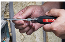
Anti-Peel Design Cushion Grips