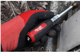
Schrader® Valve Core Remover