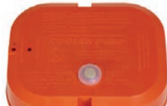
Test Button Feature