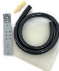
System Includes: 30" x 1/2" I.D. Drain Hose, Drain Hose Adapter, Mesh Filter & Mounting Bracket