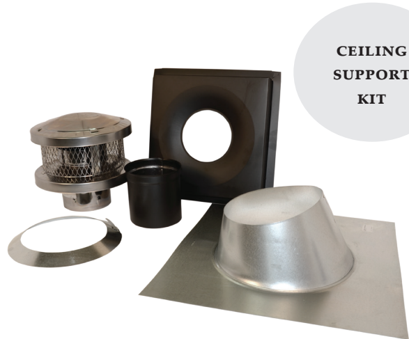
CEILING SUPPORT KIT