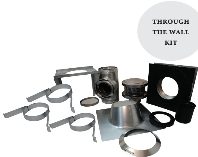
THROUGH THE WALL KIT