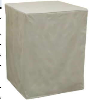
DOWN / SIDE COVER