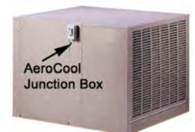
8901 / 8902 / 8778 / 8990