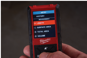
Simplified User Interface