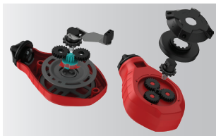
StripGuard™ Clutch & Planetary Gears