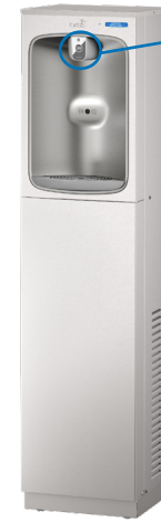
UV-C LED Treatment at the point-of dispense