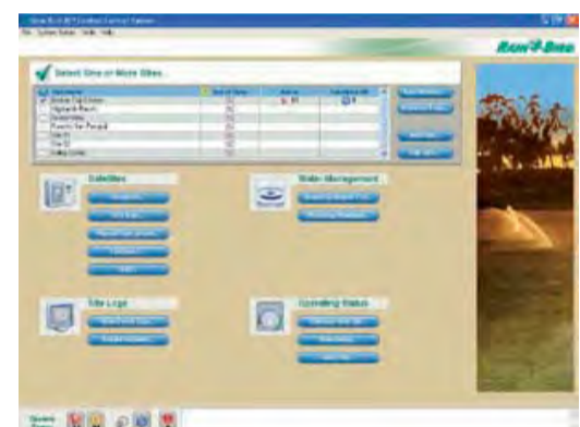
Easy-to-navigate graphical user interface

IQSTDCD: Standard Software Package, 250-Satellite Capacity