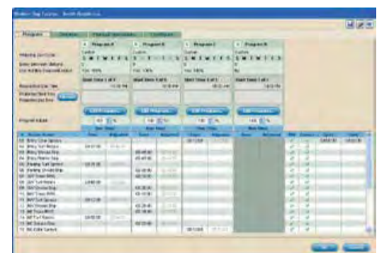
Easy-to-use program screen