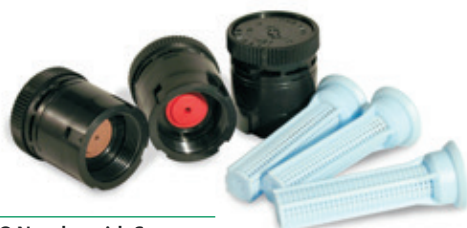
SQ Nozzles with Screens