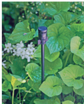
SQ Nozzle Installed on PolyFlex Riser with Nozzle Adapter