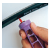
One Step Xeri-Bug™ Insertion