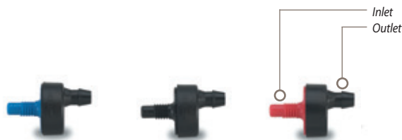
XB-05PC-1032, XB-10PC-1032, XB-20PC-1032

1032-threaded models are specifically designed to be used with PolyFlex Risers, 1032 thread adapters (1032-A), or 1800 Xeri-Bubbler Adapter (XBA-1800)