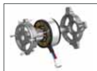
No maintenance brushless motors that provide high torque for more power and a long service life