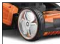
Large wheels that provide terrific traction and driving comfort