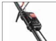
Ergonomic safety push button