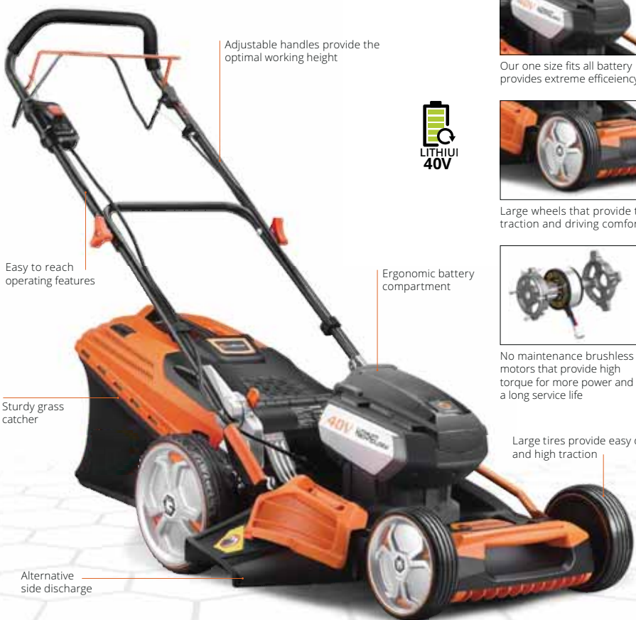
Adjustable handles provide the optimal working height