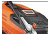
Extreme stability due to the aluminium height adjustment

Redback mowers are easy to handle, friendly for the environment and very quiet.