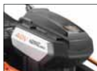
Our one size fits all battery provides extreme efficiency